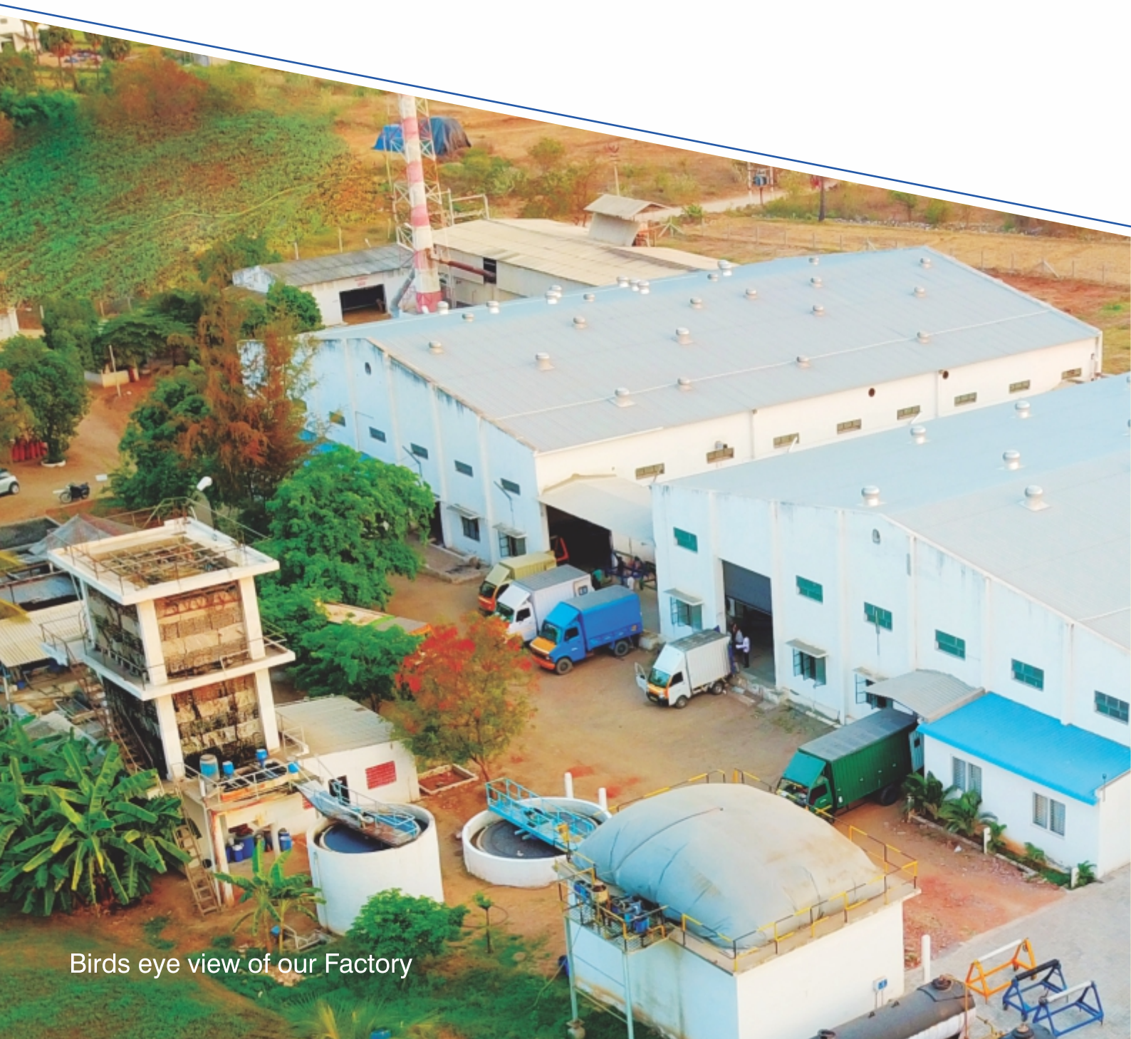
Birds eye view of our Factory

We are now into manufacture of yarn dyed, piece dyed and printed fabrics with the expertise and necessary infrastructure we have established so far.,